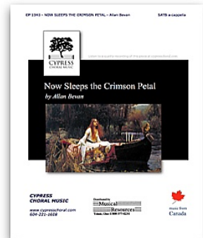
Now Sleeps the Crimson Petal