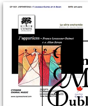
J'appartiens (I Belong)