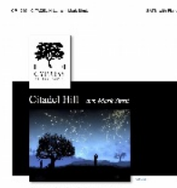
Citadel Hill (SATB, SSA)

Banks Music Publications Farwell to Tarwathie