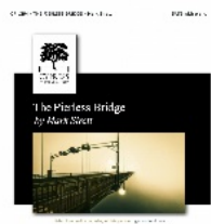
The Pierless Bridge (SATB, TTBB, SSA)