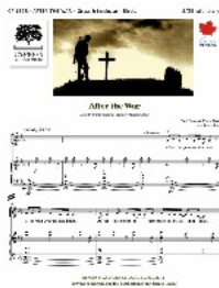
After the War (SATB, SSA, TTBB)