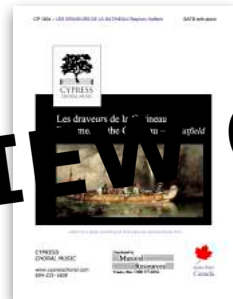
Draveurs de la Gatineau SATB