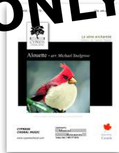
Alouette SATB and SSAA