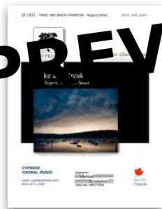
Make and Break Harbour SATB and TTBB