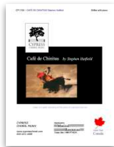
Café de Chinitas SATB

other Stephen Hatfield compositions in the Cypress Choral Music catalogue: