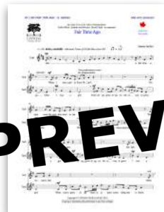
Fair Time Ago SSAA