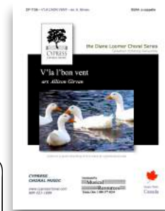
V'la l'bon vent SATB, SSAA