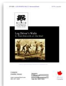
Log Drivers Waltz SSAA and SATB

other Canadian folk song winners in the Cypress Choral Music catalogue: