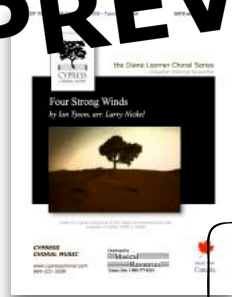
Four Strong Winds SATB, TTBB, SSAA