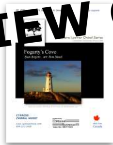
Fogarty's Cove SATB and TTBB