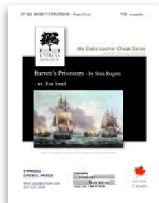
Barrett's Privateers SATB and TTBB