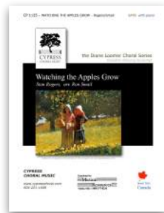
Watching the Apples SATB and TTBB