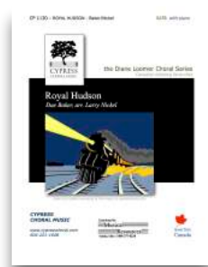
Royal Hudson SATB, SSAA, TTBB