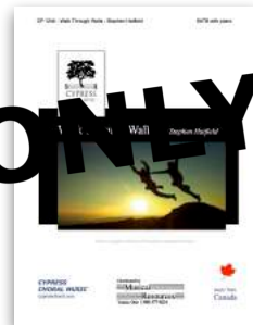
Walk Through Walls SATB

other Canadian folk song winners in the Cypress Choral Music catalogue: