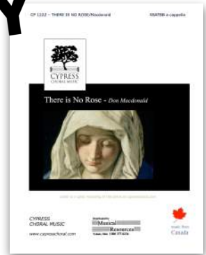
There is No Rose