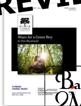
Blues for a Green Boy