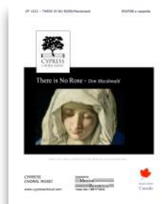
There is No Rose SATB and SSAA