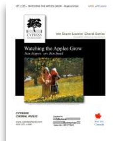
Watching the Apples Grow SATB and TTBB