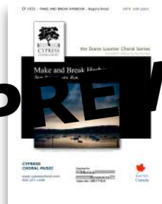
Make and Break Harbour SATB and TTBB