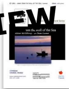
Away From the Roll SATB, SSAA, TTBB