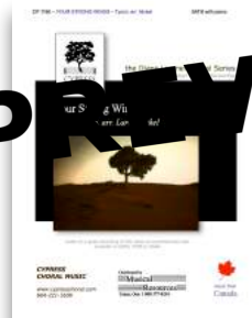
Four Strong Winds SATB, TTBB, SSAA