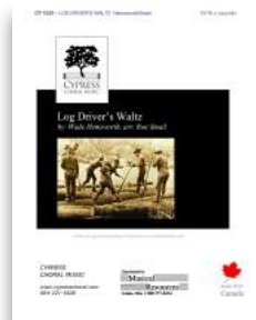
Log Drivers Waltz SSAA and SATB