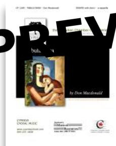
Tabula Rasa SATB and SSAA