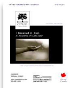
I Dreamed of Rain SATB, SSA, TTBB