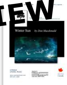
Winter Sun SATB and SSAA