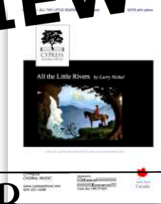
All the Little Rivers SATB and SSAA