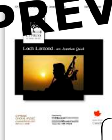
Loch Lomond SATB and SSAA