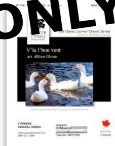
V'la l'bon vent SATB, SSAA