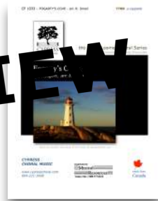
Fogarty's Cove SATB and TTBB