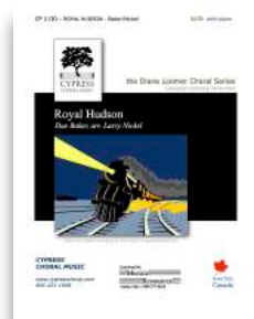
Royal Hudson SATB, SSAA, TTBB