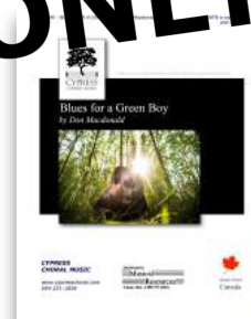
Blues for a Green Boy SATB and SSAA