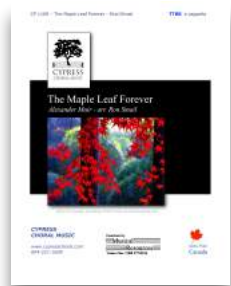
Maple Leaf Forever SATB and TTBB