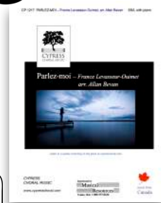
Parlez-moi SATB and SSAA