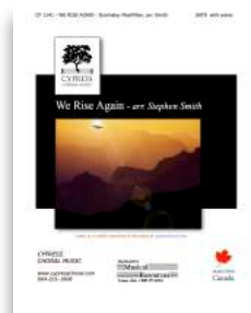
We Rise Again SATB, TTBB, SSAA