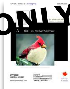
Alouette SATB and SSA