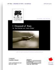
I Dreamed of Rain SATB, SSA, TTBB