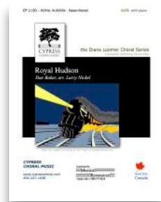
Royal Hudson SATB, SSAA, TTBB