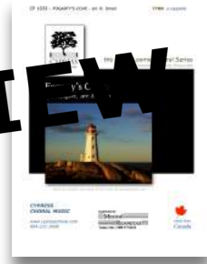
Fogarty's Cove SATB and TTBB