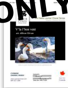
V'la l'bon vent SATB, SSAA