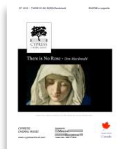
There is No Rose SATB and SSAA