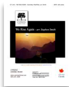
We Rise Again SATB, TTBB, SSAA