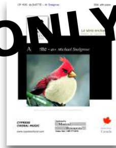
Alouette SATB and SSA