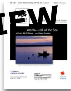
Away From the Roll SATB, SSAA, TTBB