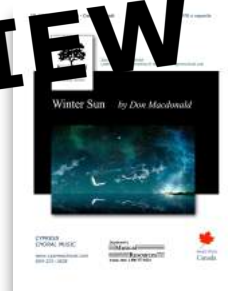
Winter Sun SATB and SSAA