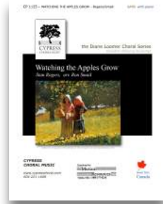
Watching the Apples Grow SATB and TTBB