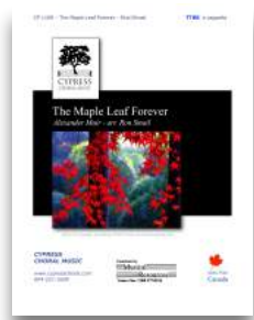
Maple Leaf Forever SATB and TTBB