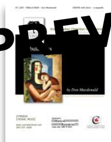
Tabula Rasa SATB and SSAA