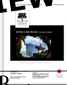
All the Little Rivers SATB and SSAA