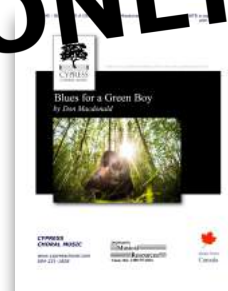
Blues for a Green Boy SATB and SSAA