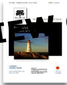
Fogarty's Cove SATB and TTBB