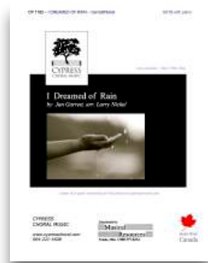
I Dreamed of Rain SATB, SSA, TTBB