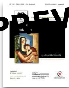
Tabula Rasa SATB and SSAA