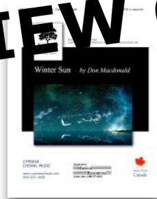
Winter Sun SATB and SSAA