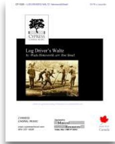
Log Drivers Waltz SSAA and SATB