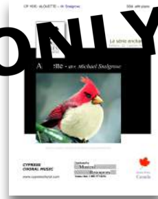
Alouette SATB and SSA