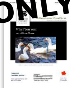
V'la l'bon vent SATB, SSAA