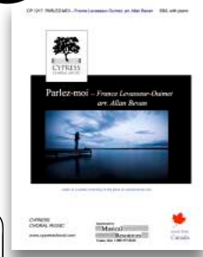
Parlez-moi SATB and SSAA