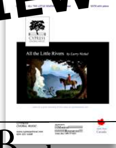
All the Little Rivers SATB and SSAA