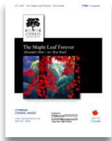
Maple Leaf Forever SATB and TTBB