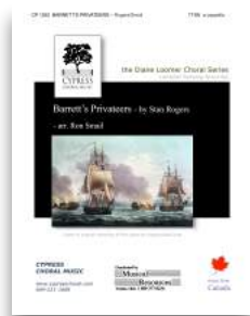
Barrett's Privateers SATB and TTBB