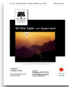
We Rise Again SATB, TTBB, SSAA