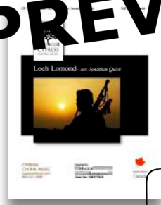
Loch Lomond SATB and SSAA