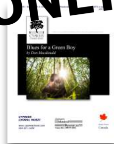
Blues for a Green Boy SATB and SSAA