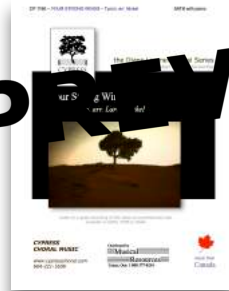
Four Strong Winds SATB, TTBB, SSAA