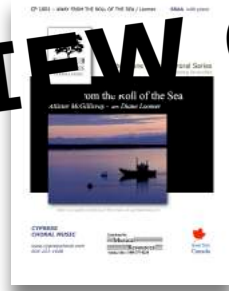
Away From the Roll SATB, SSAA, TTBB