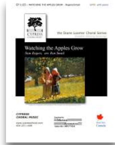
Watching the Apples Grow SATB and TTBB