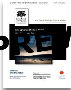
Make and Break Harbour SATB and TTBB