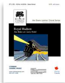
Royal Hudson SATB, SSAA, TTBB