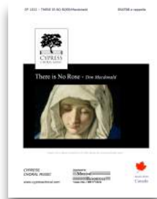
There is No Rose SATB and SSAA